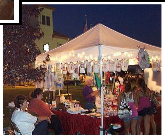
Friday Evening Under the Stars