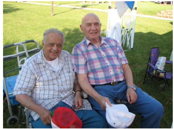
Enjoying a Beautiful Evening Outdoors