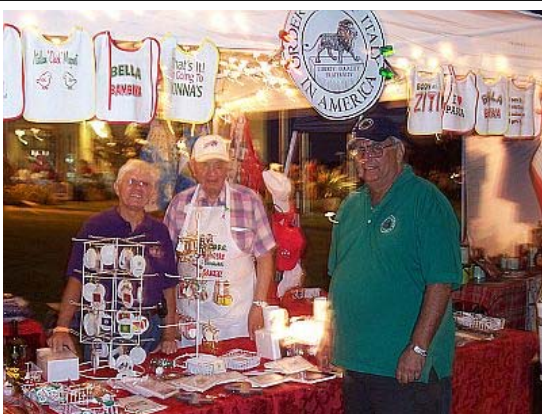
Friday Evening Fun Under the Lights