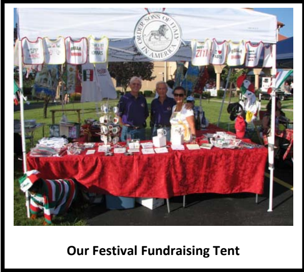
Our Festival Fundraising Tent