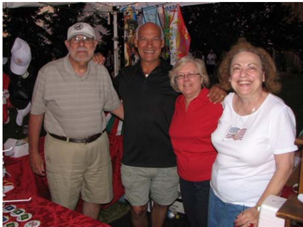
A Fantastic Saturday Evening Sales Team