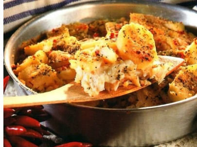
Puglia - Tiella di Baccala Salt cod with tomatoes, potatoes and subtle spices baked in a round metal pan