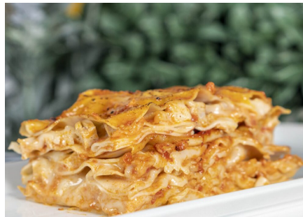
Lazio - Roman Pasta al forno Baked pasta al forno with bechamel sauce.