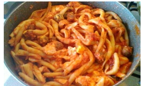
Calabria - Scillatelle con ragu Long shaped pasta topped with pork based ragu tomato sauce