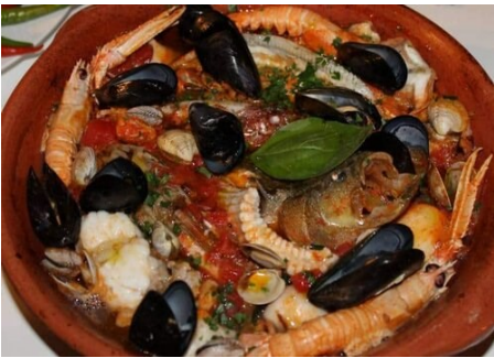
Marche - Bordetto Seafood stewed in tomato sauce