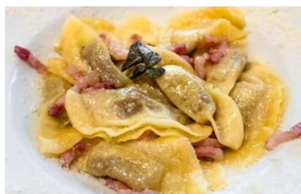
Lombardy - Casoncelli Handmade ravioli type pasta in turkey broth with butter, pancetta and sage