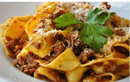
Tuscany - Pappardelle with Ragu Traditional egg pasta with meat sauce.