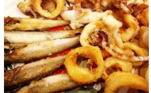
Campania - Frittura di Pesce Assorted fried seafood