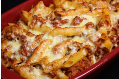
Sicily - Ncasciata Pasta Baked pasta filled with meatballs, sausages, ragu, boiled eggs, and cheese

In Italy, the holiday season runs from the Feast of the Immaculate Conception on December 8th, through the Epiphany on January 6th, but Christmas is celebrated over the three days from December 24th to December 26th. Each of the 20 regions has a different culinary tradition this day. The pictures below represent some of the traditional dishes.