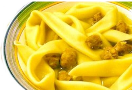
Liguria - Natalini Flat pasta cooked in broth with tiny meatballs