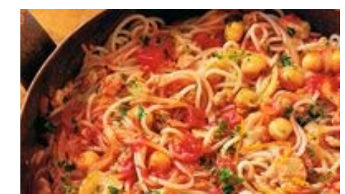
Abruzzo - Fedelini Handmade spaghetti in tomato sauce with canned tuna and chickpeas