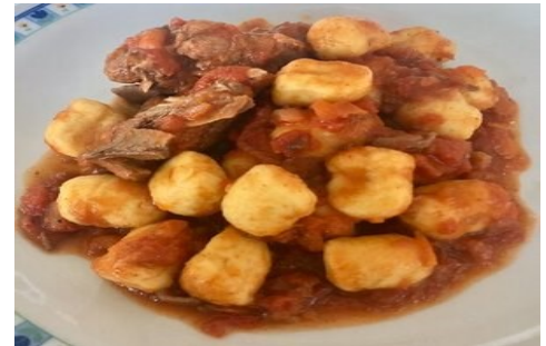
Veneto - Gnocchi with Duck Handmade gnocchi with duck ragu