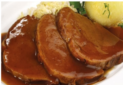
Piedmont - Brasato Braised chuck roast in Barolo red wine.