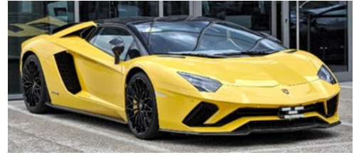
Po River, Feb. 2023