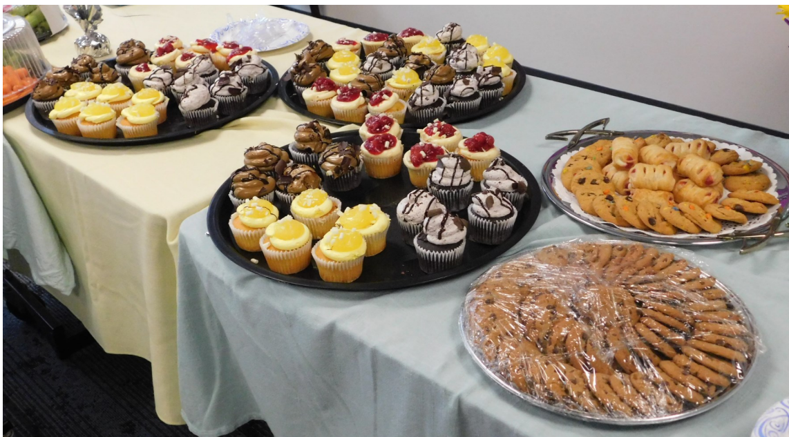
And always a good spread!