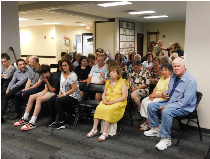
Members and guests during the award presentation