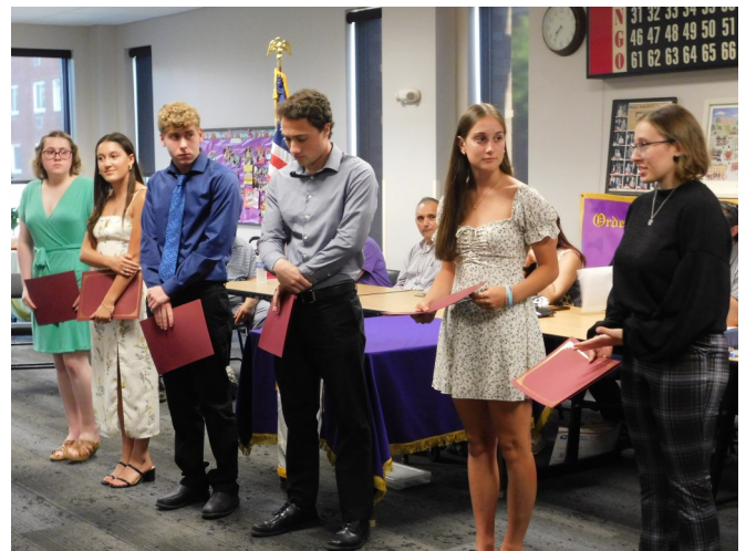
Students telling a bit about themselves