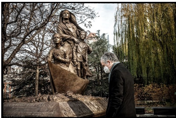
The Consul General of Italy at the Mother Cabrini Statue, Battery Park, December 13, 2022

The story that surrounds this wine goes back to the 6th century. Principessa Gavia fell in love with a soldier, but her father, Clodimir, King of the Franks, forbade them to marry, and so the young lovers eloped to a remote village in Northwestern Italy. After a night of gaiety and enamored by the delicious white wine, the couple revealed their identity. News got back to the king and when he saw how happy they were, he forgave them and blessed their union. To honor his daughter, the king named both the village and its wine after his daughter. It is said their romance lives on in each glass of Principessa Gavia Gavi.