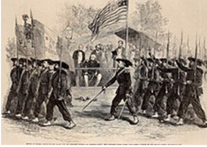
(picture: March past of the 'Garibaldi Guard' before President Lincoln and General Scott, 4 July 1861,)

I sat in my Civil War class today (5/2/2023) and the instructor was talking about the Battle of Bull Run in Manassas, Virginia.