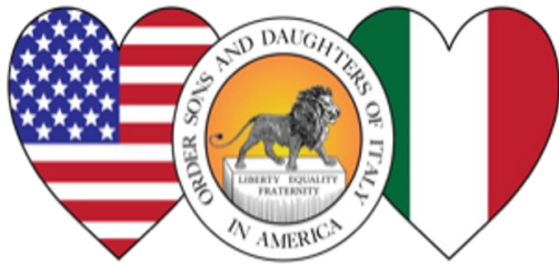
VINCENT LOMBARDI LODGE #2270