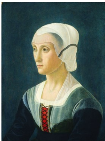
Lucrezia Tournabuoni, 1475 CE, attributed to Domenico Ghirlandaio, Florentine 1449-1494 CE, Samuel H. Kress Collection 1952.5.62

Made from 100% negroamaro grape with 14.5% alcohol. The vineyard is sustainable, harvest by hand, and fermentation and aging occur in concrete and followed by six months in French barrique. The bottle of wine is aging gracefully and has flavors of cherry, leather, graphite, coffee liqueur, and dried mint that finishes in a spicy, smoking note. Pairs well with grilled steak.