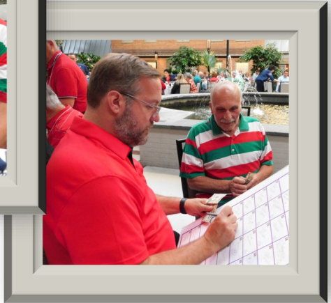
The Vincecent Lombardi Lodge was well represented.