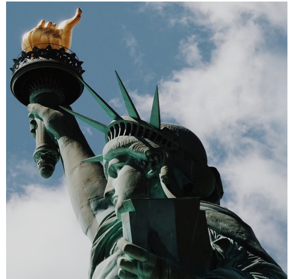
The copper statue, a gift to the U.S. from the people of France, was designed by Frédéric Auguste Bartholdi and its metal framework was

The Statue of Liberty is one of New York's most impressive monuments. Not just for her symbolism but for how accomplished the structure was for the time period. While much of that original statue still stands, the torch you see in Lady Liberty's right hand is much newer than the rest of her. You might think it's just another piece of her wardrobe, but the Statue of Liberty's torch is one of her most significant and symbolic elements. By the 1980s, it was decided to replace the original torch with an exact replica of Bartholdi's original design. In 1986, the current torch was installed, which has a flame covered in 24-karat gold.