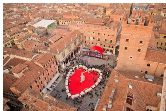
Verona's historic Piazza dei Signori , home of Romeo and Juliet

Valentine's Day is historically Italian, dating back to the Roman Empire in the 6th Century B.C.. Many historians believe that Valentine's Day is an offshoot of the ancient pagan fertility ritual of Lupercalia, celebrated in the middle of February. The festival began with the sacrificial slaughter of a male goat and dog by a group of Roman priests called Luperci, and continued with raucous feasting, the consumption of wine, and couples pairing off for an entire week.