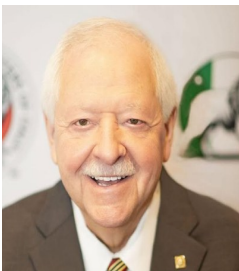
OSDIA'S NATIONAL PRESIDENT 2025 - 2027